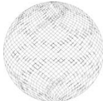
Orbitor 4 nozzle spray pattern