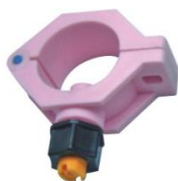
KC-01 1" clamp