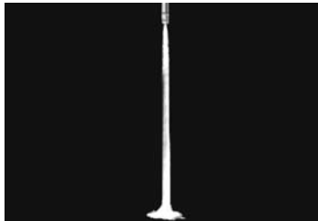
0° Straight Jet