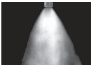
70° Hollow Cone