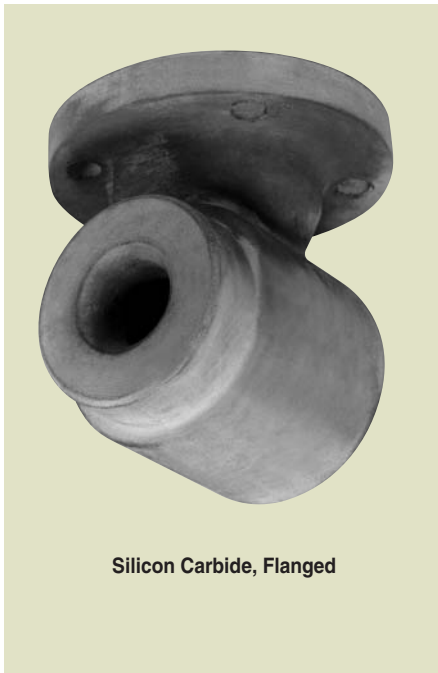
Silicon Carbide, Flanged

Dimensions are approximate. Check with BETE for critical dimension applications.