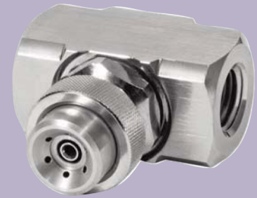
1/4" XAER850A XA 00 Body; A Hardware

Dimensions are approximate. Check with BETE for critical dimension applications.