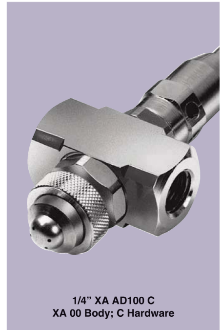
1/4" XA AD100 C XA 00 Body; C Hardware

Dimensions are approximate. Check with BETE for critical dimension applications.